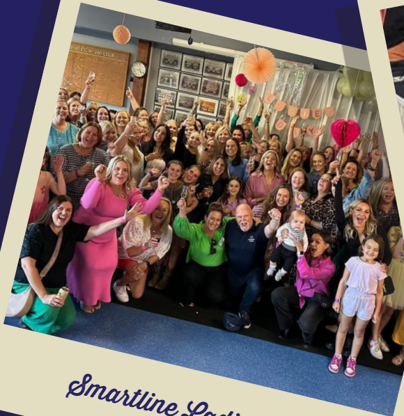
Smartline Ladies Day

Smartline Ladies Day Sunshine Football Club